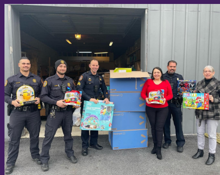
Thank you to the generosity of the Bethlehem Police Department for making sure the kids at our Safe House had a very merry day!