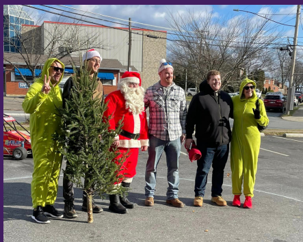
Thank you to More Miles Automotive, Lehigh Valley with Love, and the community for helping to raise over $1,400 for Turning Point at the 2022 Christmas Tree Toss for Charity!