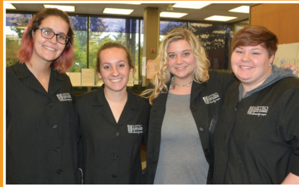
Volunteers from Metro Beauty Academy sharing their time and talents